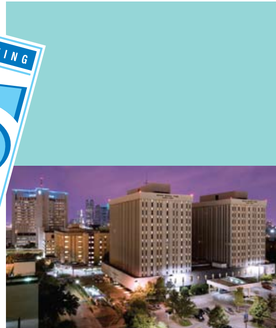
Baylor University Medical Center at Dallas Baylor All Saints Medical Center at Fort Worth

With one phone call, a physician can request additional information, an appointment for a patient, or a consult. Call 1-800-774-2487 and a Baylor Regional Transplant Institute representative will assist you.